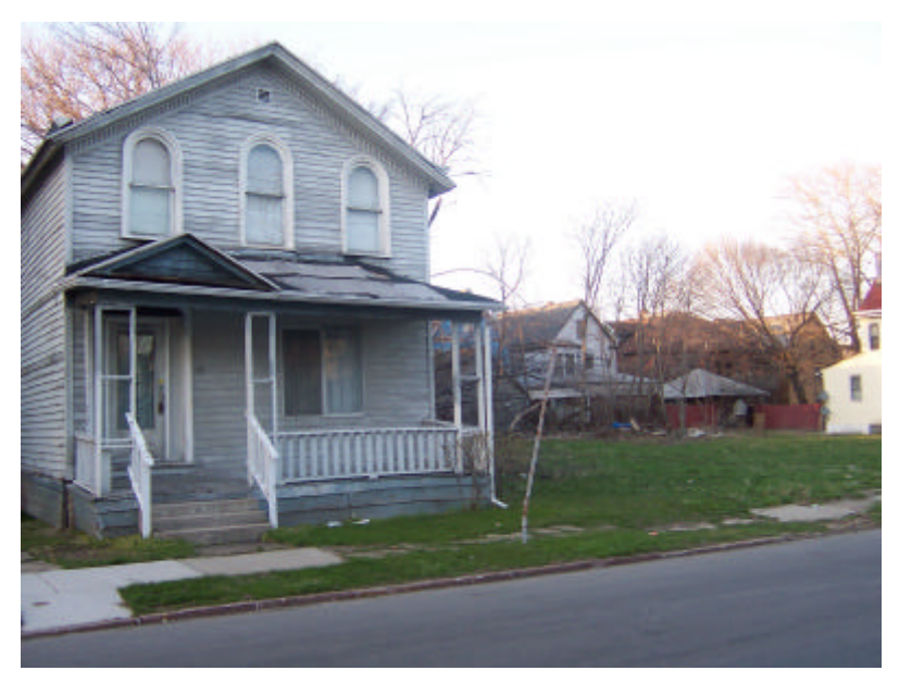
Riley Street is the home of many post-Civil War structures older than the typical houses of Midtown.

The brick livery stable at 65 Riley is a small building with vast potential as a placeholder for the corner of Holland and Riley. The City should strongly consider: