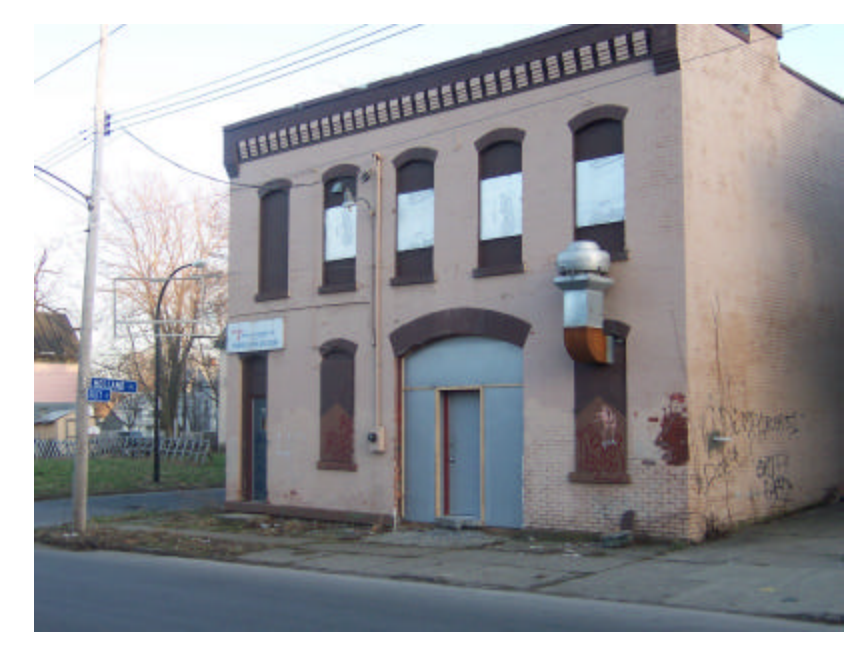
Riley Street's next corner store, if only the City were to step in. Could the former horse stable at 65 Riley fill a crucial gap in community life?