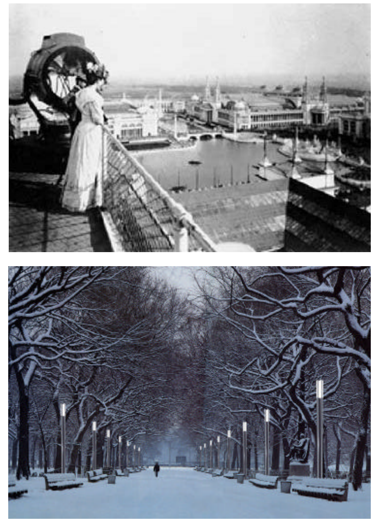
East Utica Street would look a lot different if its Elm canopy were restored.

This plan has identified spaces outside the Utica Street Metro