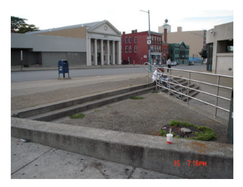
The Utica Metro station has underutilized outdoor spaces simply begging to be picked up by an entrepreneurial espresso cart owner or regional farmer.